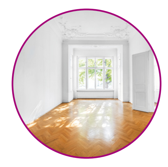
The wall and window sill for heating and cooling are ready. Healthy indoor climate included