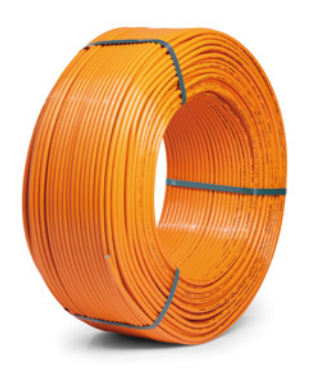
Easy and quick installation with the flexible and stable VarioProFile pipe.