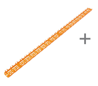
Mount the VarioRail on the wall using the special click system.